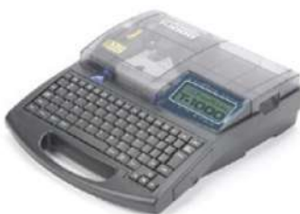
PRO Mark T1000

Professional marking equipment for designing and making markers. Portable printers are perfect for ongoing service works and use on sites, where the built-in keypad will enable you to make the marker necessary in no time. Larger machines are intended for desktop use and for advance production of the required markers.