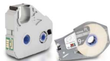
Ribbons & Accessories