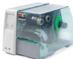
MK10 / EOS1&2