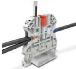
Screw connection technology